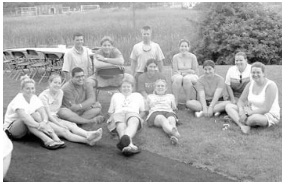
Orientation Leaders & Coordinators take a breather at Odells last week before working on some last minute details.