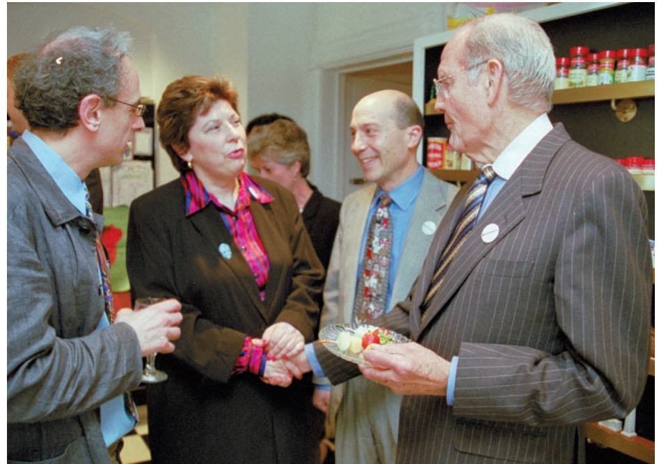
Sen. McGovern speaks to HWS profs. at a reception before his speech last Thursday.

McGovern remembers watching a TV program that interviewed a young boy who could not afford to eat in his school cafeteria. The boy commented, "I'm ashamed because I haven't gotten any money." McGovern then thought to himself that, "It is George McGovern of the US Senate that should be